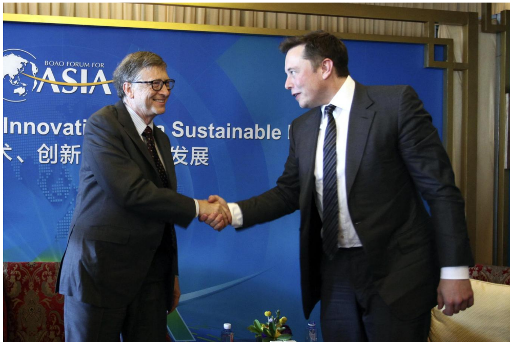
Both Bill Gates, left, and Elon Musk have warned that humanity could soon be destroyed by AI

He invites us to imagine the UN receiving an email from an advanced alien civilisation. We are on our way, the email warns, and will land in 30 to 50 years. “Pandemonium”, he says, would hardly describe the reaction. But this is where things stand. We do not know when a superhumanly intelligent machine will be developed, but it will be. Probably within the lifetimes of our children.